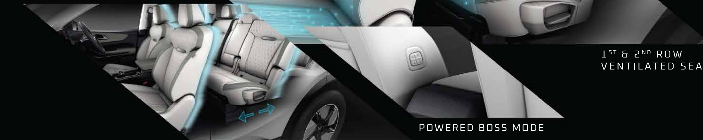
1 ST & 2 ND ROW VENTILATED SEATS

A sturdy fold-out tray for everyday working needs.